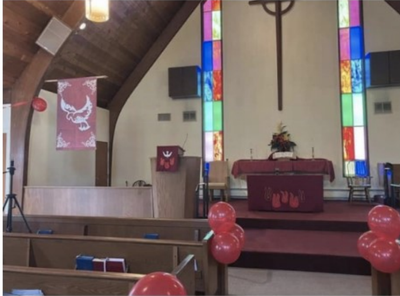
Pentecost Sunday, Kirk of Our Savior

I walked among the congregation and called upon anyone who raised their hand. They were sharing joys and concerns with one another before we had a time of prayer. Folks shared about their neighbors and friends who were recovering from medical needs. Then a kind man raised his hand, and I walked over to him next.