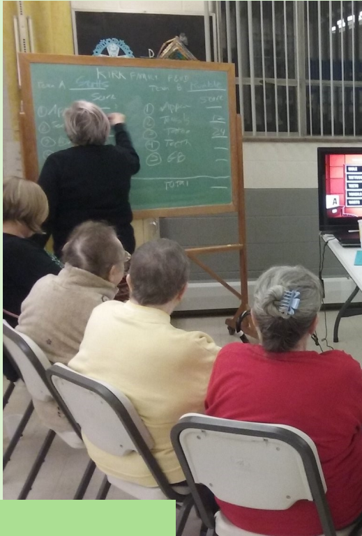
Family Feud and Chili in Fellowship Hall